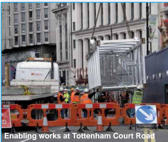
Enabling works at Tottenham Court Road

Major works will need to be undertaken at the eastern end of Oxford Street from early 2010. This will require a lane closure between Newman Street and Tottenham Court Road, with some bus services affected.