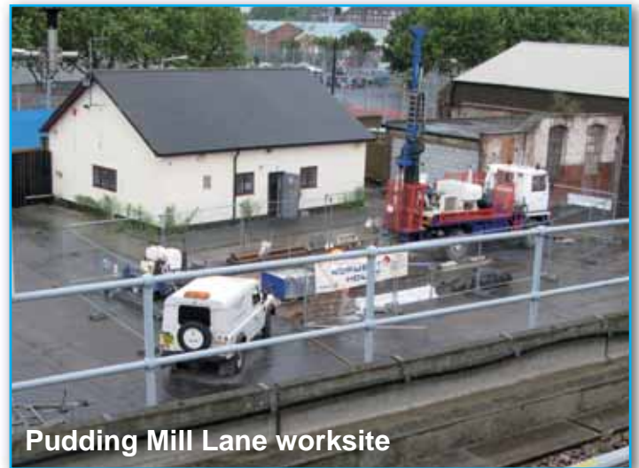
Pudding Mill Lane worksite

WORK has started at Pudding Mill Lane, near Stratford, on enabling works.