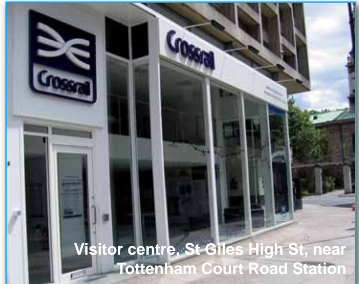
Visitor centre, St Giles High St, near Tottenham Court Road Station

The Tottenham Court Road area has been chosen as the location for the first visitor centre as the works here are the most advanced and it