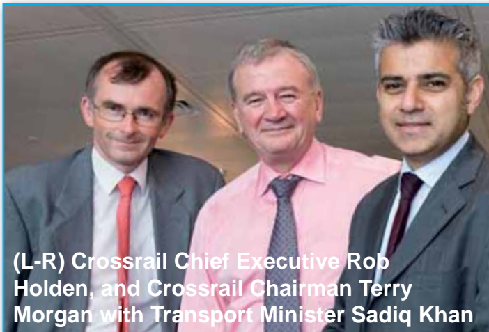
(L-R) Crossrail Chief Executive Rob Holden, and Crossrail Chairman Terry Morgan with Transport Minister Sadiq Khan

Information displays with details of the construction works at Tottenham Court Road Station and along the route are also available. The Visitor Centre is located at 16-18 St Giles High Street, WC2H 8LN.